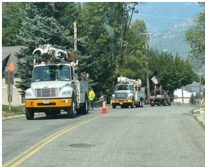
Figure 1: Avista Utilities working to install upgraded power from the nearby substation up Division Street in Wardner and to site.

In parallel with the portal upgrade, Bunker Hill partnered with Avista Utilities and Wilson Construction Co. and connected the Wardner footprint with mainline power. This involves equipping the site with 1.85MW of electricity, generated through the hydroelectric-dominated supply of the Pacific Northwest, at rates of below 6c per kwh as the operation gets underway and below 5c per kwh as cumulative electrical usage ramps up and the operation falls into the highest-usage category. This is a significant milestone for Bunker Hill's operating cost base and for the first time gets the site away from exclusive reliance on diesel generators at Wardner.