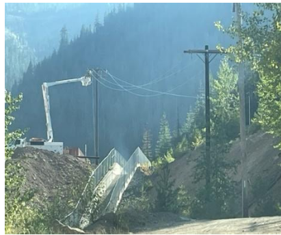
Figure 2: Wilson Construction Co. installing overhead powerlines on Bunker Hill property.