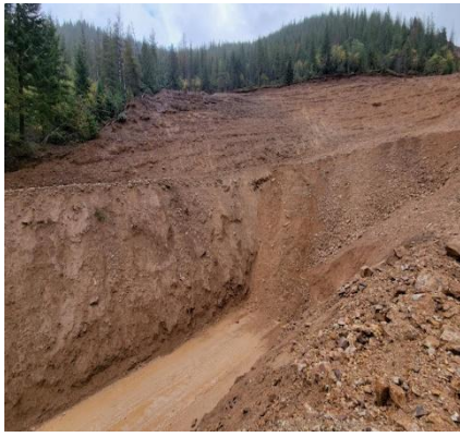
Initial earthwork in support of portal.