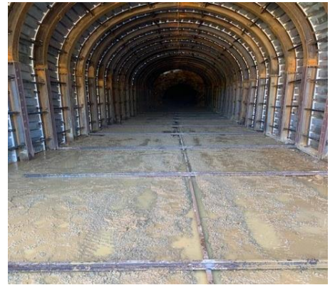
Spreaders inserted prior to burying steel sets.