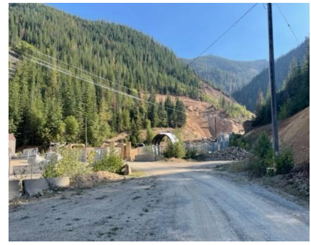
Figure 3: Overhead power installation complete at Wardner.