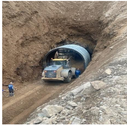
First set of steel sets being positioned.