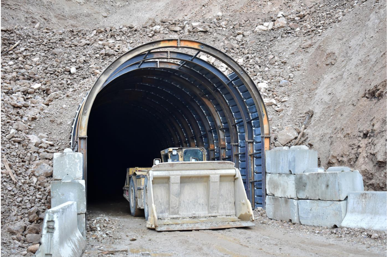
14 Oct - Newly completed and enlarged Russell Portal