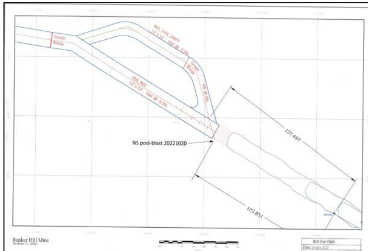
Engineering design of primary fan drift that is currently being excavated between the 5 & 6 Levels