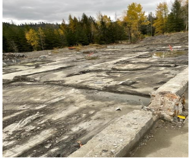
Final state of the Pend Oreille Crusher Building (L) and Mill Building (R)